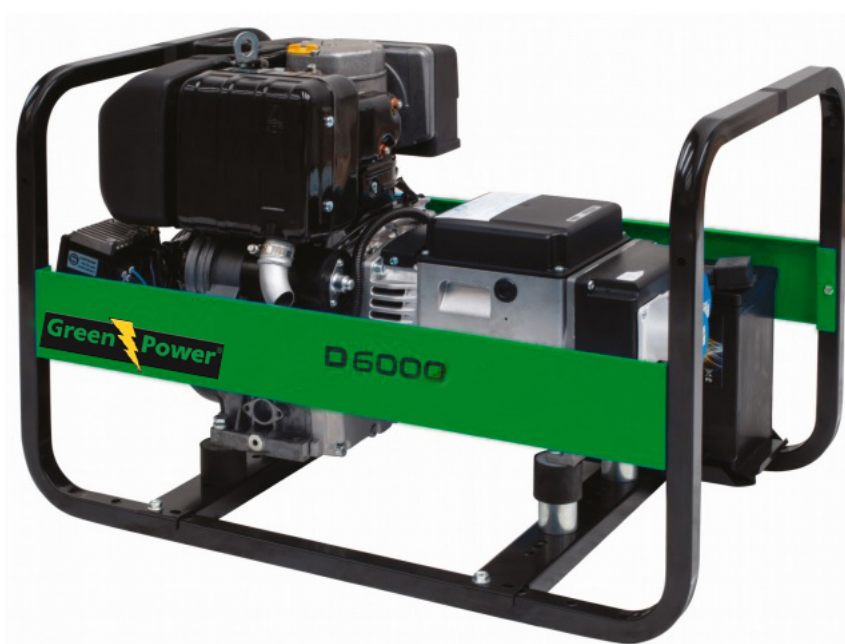
The image is only for demonstration purposes

GreenPower series generating sets, 3000 rpm, equipped with KOHLER diesel engines with electric starting system with key and battery. These generating sets are characterized by lower consumption and a longer life expectancy compared to the petrol powered range. 3000 rpm gensets have been designed for stand-by use only. Not recommended using for more than 6 hours continuously or more than 500 hours/year.